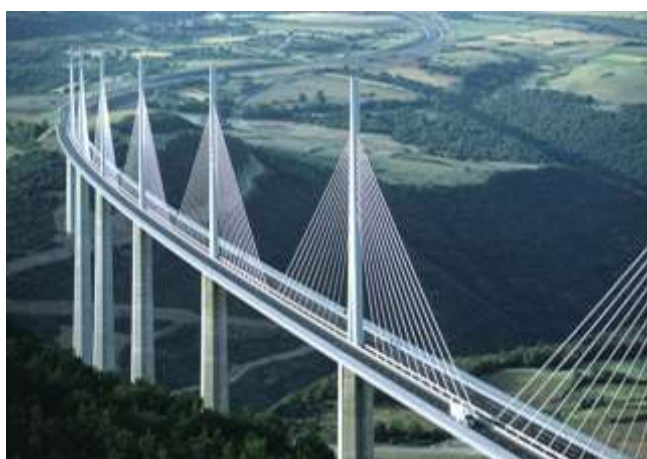
Fig: 2.2.1. Cable Stayed Bridge

The requirement of incredible long span bridges is increased day by day with increase in inhabitants and their needs. To achieve a very long span bridge, use of high strength material along with novel structural system is essential. To achieve longer span bridges and good structural system the cable stayed bridges are used, in which the cable-stayed bridge has better structural stiffness than suspension bridges.