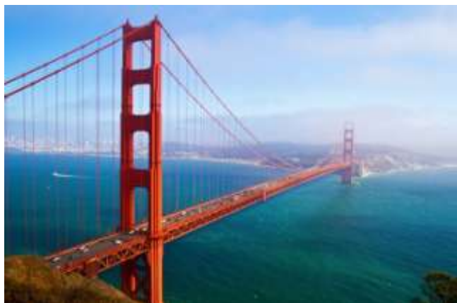
Fig: 2.1.1. A Typical Suspension Bridge

As an outcome, optimization techniques are frequently employed with the purpose to identify the structural behavior of the bridge with respect more complex external loads such as aero elastic and seismic phenomena. However, most of the methodologies are typically concerned to evaluate optimum post-tensioning forces in the dead load configuration, without achieving the complete optimization of the geometry, the stiffness of the structural elements and thus cost of construction [2].